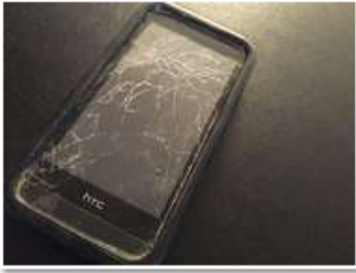
James Rogers' cell phone, recovered after a trench collapse.